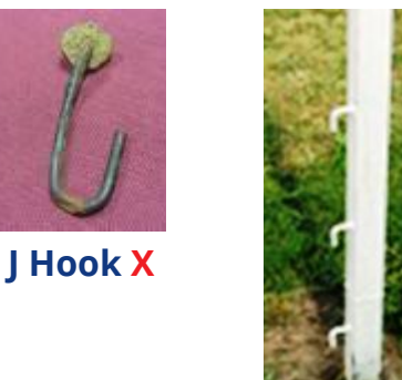
L Hooks on goal X